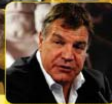
INSIDE... Newcastle United Chief backs Lean East!