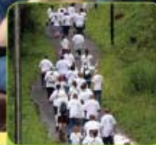
INSIDE... East End Fun Run snaps!