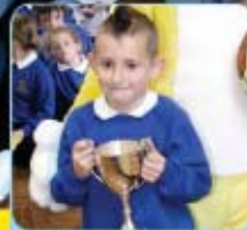
INSIDE... Lean East Rabbit competition winner announced!